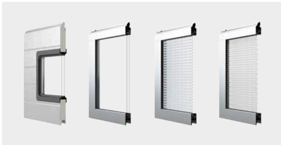
SPECIAL SECTIONS (from the left): IS/IA with windows, IP with double glass, IP with perforated sheet, IP with aluminium net

Steel door panels with windows or glazed aluminium sections are an interesting solution. They are filled with single or double window made of plexiglass resistant to scratching. Industrial doors made of glazed sections may serve as shop windows or they may discretely divide the space in the room if they are filled with matt, smoky or milk glass.