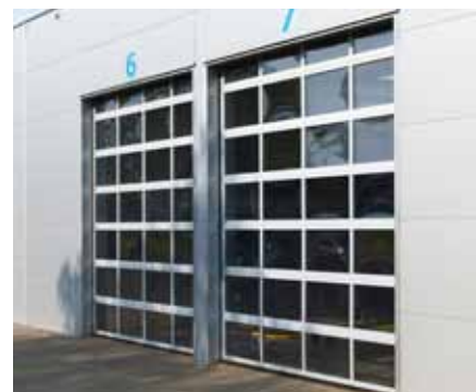
SECTIONAL DOOR K2 IP with glazed sections