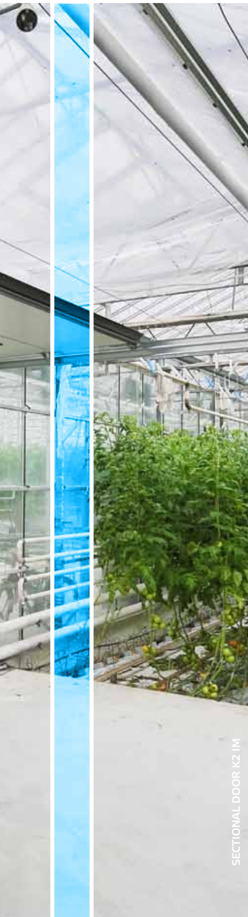
SECTIONAL DOOR K2 IM

We constantly develop and upgrade our products. We offer numerous accessories. Side doors matching the garage doors or service doors allow to enter the building without the need of opening the garage door. The highest quality of raw materials and automation of renowned producers is the guarantee of the doors' durability and reliability.