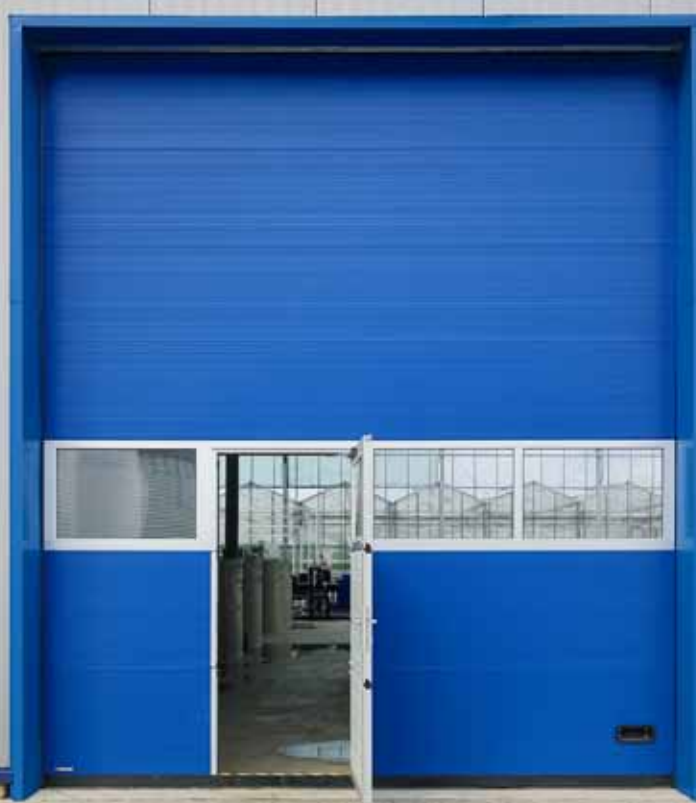
SECTIONAL DOOR K2 IM

We provide our customers with the innovative solutions, which are appropriate for every conditions. No matter if it is a small workshop or a production hall of an extensive surface. For every investment it is equally important to provide safe and comfortable conditions for business development. Our products from FIRM line are purposely made to meet these conditions.