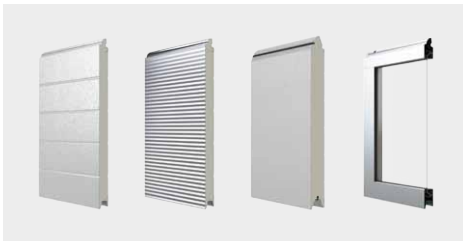
SECTIONAL DOORS PANELS (from the left): K2 IS/K2 IA panel, K2 IM panel, K2 IS 60 panel, K2 IP panel

Door sections are 40 mm thick and they are filled with polyurethane foam. The warmest door KRISPOL K2 IS 60 is recommended for the buildings requiring high thermal insulation. It is built of plain 60mm panels and it has the developed system of perimeter sealing – double sealing on the bottom panel and two-lip side sealing. Apart from steel type of doors, we also offer K2 IA and K2 IP aluminium doors. K2 IA doors with narrow embossing look identical as their steel counterpart K2 IS, but are lighter and have a higher class of resistance to corrosion. The fully glazed K2 IP doors are an interesting alternative for full doors. They are characterized by modern design, they expose the interior of the buildings and provide more daylight inside.