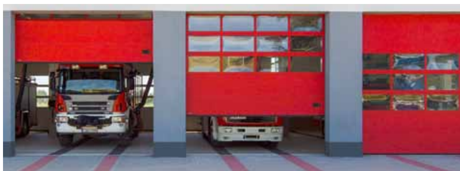
SECTIONAL DOOR K2 IA aluminium with glazed sections