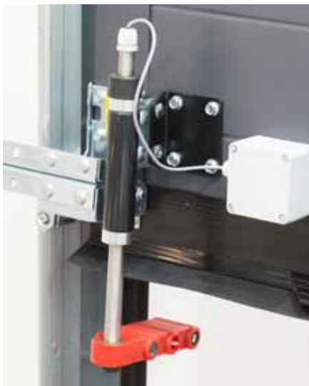
PHOTOCELL The photocell before the door additionally increases the level of safety.

The chain of authorized KRISPOL Partners guarantees a quick help and professional installation and services. Providing the investment with products will guarantee the convenient servicing and feeling of safety. Your company is of a great value. The solutions applied in our doors will help to take care of its full safety. A professional advisor from the authorized KRISPOL sales point will help to find exactly what you need.