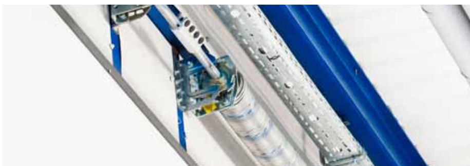
SAFETY MEASURES Each door is equipped with safety feature in case of line or spring breaking.