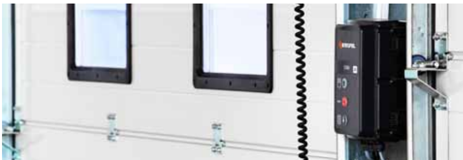
COMFORTABLE STEERING Different options of the door steering guarantee comfort for all users.