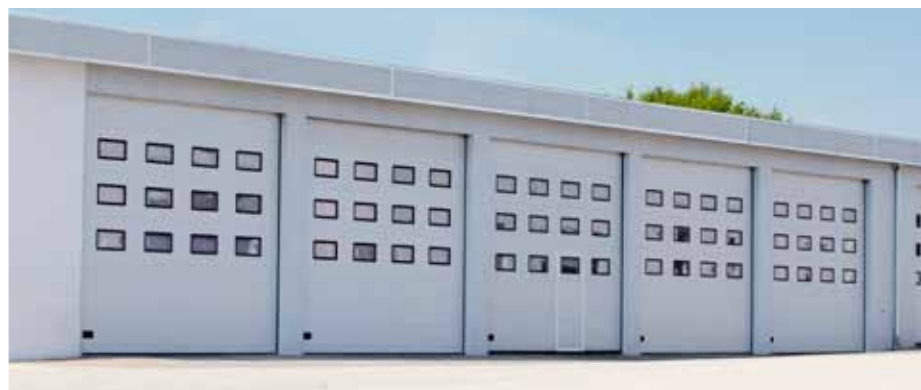
STEEL DOORS SECTIONS WITH WINDOWS Provide more daylight and improve work conditions.