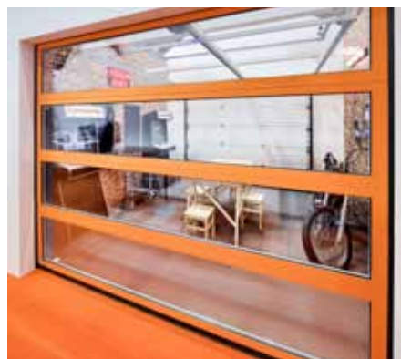
IP SECTION WITHOUT VERTICAL POLES The door serve as a shop window thanks to glazed sections.