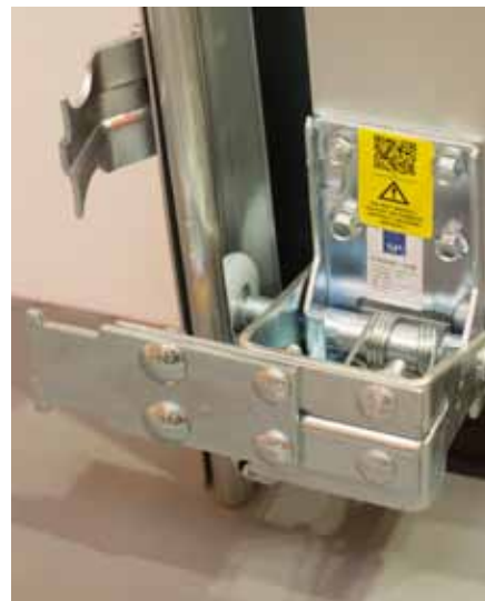
ANTI-LIFT DEVICE The solution stopping the prying of the door from outside.