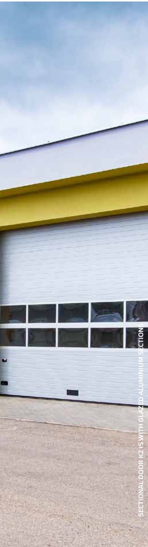
SECTIONAL DOOR K2 IS WITH GLAZED ALUMINIUM SECTIONS

The chain of authorized KRISPOL Partners guarantees a quick help and professional installation and services. Providing the investment with products will guarantee the convenient servicing and feeling of safety. Your company is of a great value. The solutions applied in our doors will help to take care of its full safety. A professional advisor from the authorized KRISPOL sales point will help to find exactly what you need.