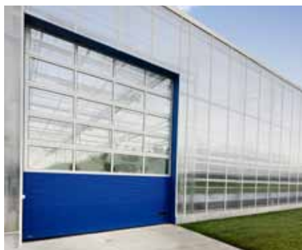
SECTIONAL DOOR K2 IM steel, glazed, micro profiled